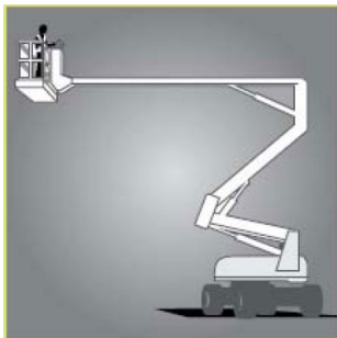
Figure 1 – An example of a boom-type elevating work platform. The safety harness and lanyard are not shown for the purpose of clarity.