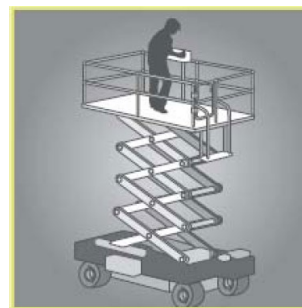
Figure 2 – An example of a scissor-lift elevating work platform